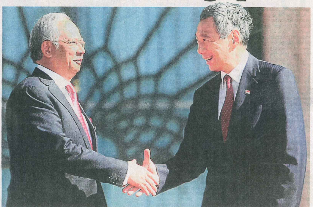
Prime Minister Datuk Seri Najib Razak greeting his Singapore counterpart, Lee Hsien Loong, at the Malaysia-Singapore Leaders' Retreat in Putrajaya yesterday.

The leaders also discussed cooperation in → Turn to Page 3